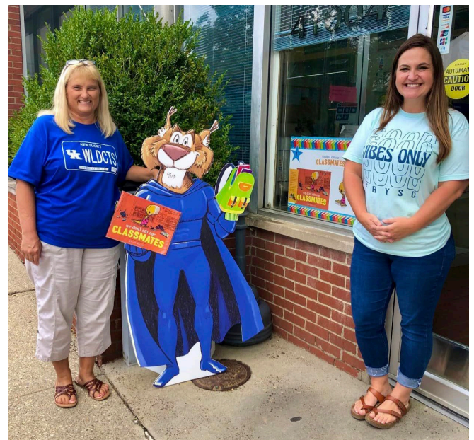
Opening Day of the Story Book Walk

After the program was over, we gave the local daycare the posters and they are going to use them at the center for the kids to read.