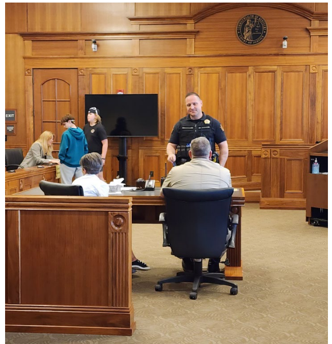
Students in the courtroom scenario.

Students were impacted by learning about real situations of being involved in legal and illicit drugs. It was evident that the students took the scenarios seriously as they were conversing with each community partner. Of the 115 students who participated and responded, 80% reported a better understanding of the legal consequences of substance abuse, 75% reported a better understanding of the harm and risk of substance abuse and 90% reported knowing where to turn in the community to access help.