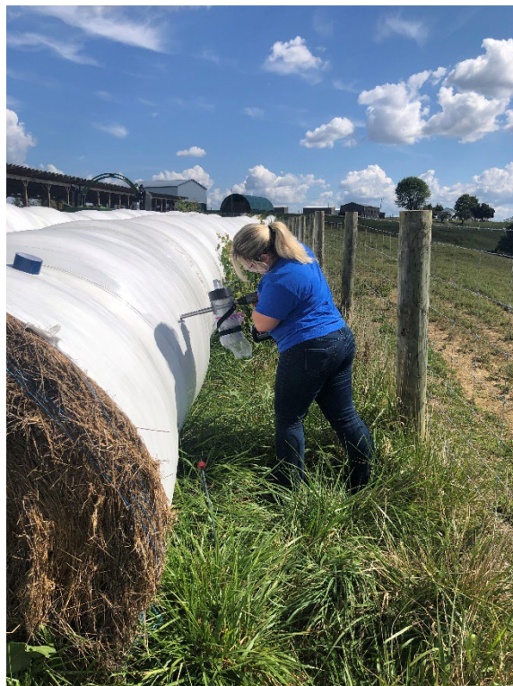
Agent collecting samples at local farm.

This year's contest was a celebration of what makes Bracken County special - our commitment to quality, our sense of community, and our pride in agriculture.